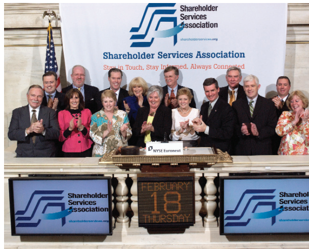
SSA Board of Directors ring the closing bell at the New York Stock Exchange.